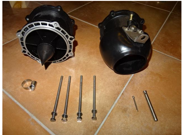
Unscrew plastic cone. If you are strong, by hand or with some big pliers. Don't squeeze plastic cone. Remove rubber seal.