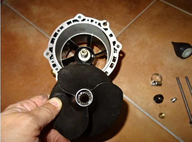
Security insert have function to prevent unscrewing of the impeller. Note alignment.