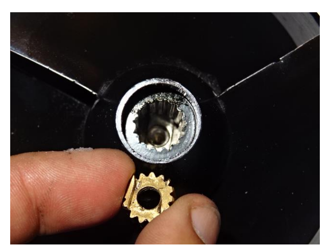
To place it back in position use same procedure (long screw). Note alignment.

Security insert have function to prevent unscrewing of the impeller.