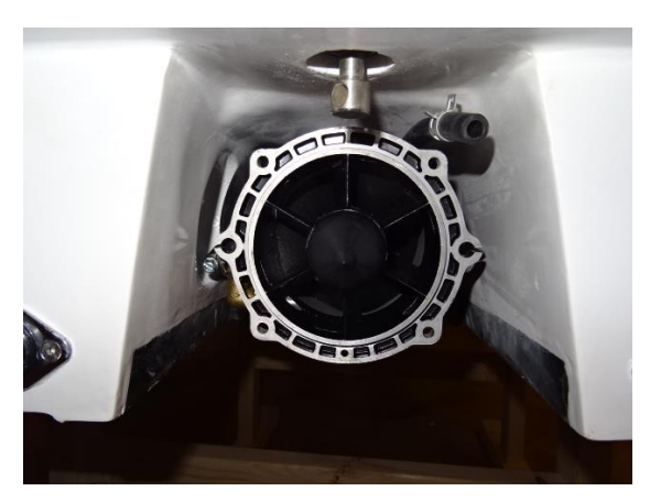
Release rubber hose -cooling water supply