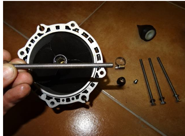
Screw long screw in the hole of brass security insert. Pull it out. Wiggle if needed.