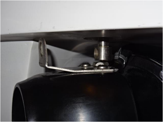
Unscrew 4 long screws, key 10 mm ( lower plate is removed for better visibility ) Unplug rubber vacuum line.